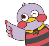
Saitama Mascot, Saitamatch

Saitama Prefecture is committed to supporting the education of high school students through the provision of interest-free loans and school-fee reduction systems. Please see the following for more information about the various types of financial assistance available and how to apply.