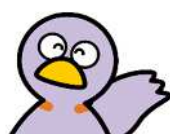
Saitama's Mascot Kobaton